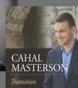
International Concert Pianist Northern Ireland