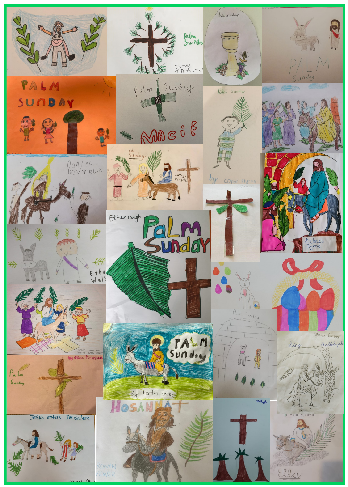
Hosanna! Blessed is He who comes in the Name of the Lord. Hosanna! Artwork from St. Mary's National School, Ballygunner