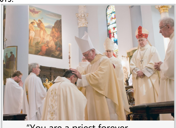
"You are a priest forever, in the order of Melchizedek."